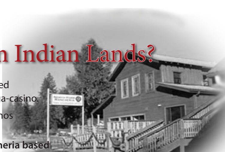
North Fork Rancheria Tribal Office Sierra Foothills off Route 41

Station's solution: They recruited the North Fork Rancheria based in the Sierra foothills, nearly 50 miles away from the Highway 99 casino site, to petition the federal government to declare the Highway 99 casino site as their tribal reservation.